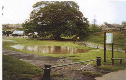
Figures 3 and 4: Sand filter during construction and post-construction showing surcharge above the device